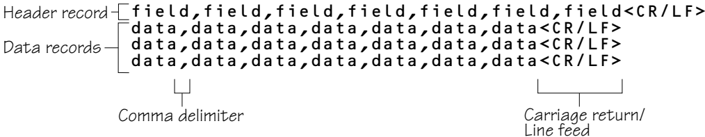
Components of a Paydata Import File

The following illustration shows the components of a Paydata Import file.